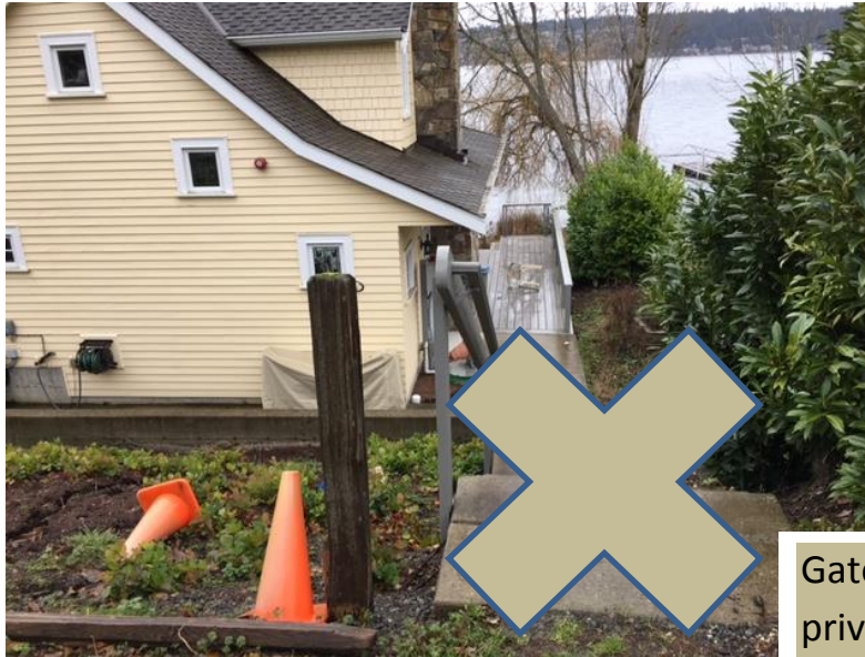
Gate for privacy, safety and security.

➤ We request the County to place a gate in the fence at the top of these stairs to ensure privacy, safety and security of our home and property, and cleanliness from trail dog waste.