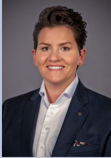
Kali Clark Mayor